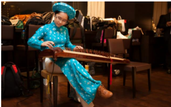
Vietnamese instrument performance in the banquet