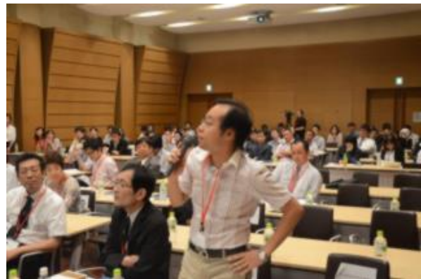
Q&A in the plenary session