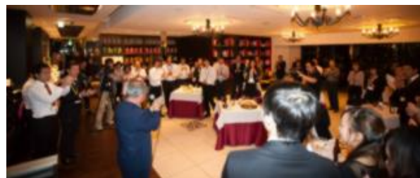
The banquet closed by "Osaka jime"