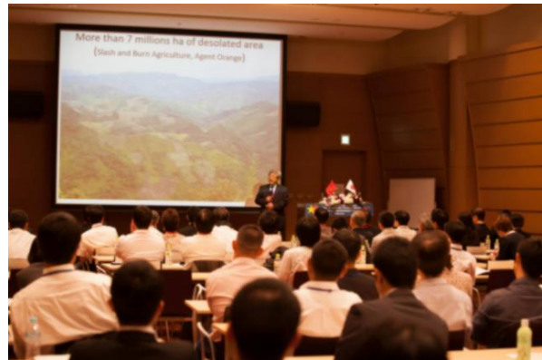
An invited talk in the plenary session