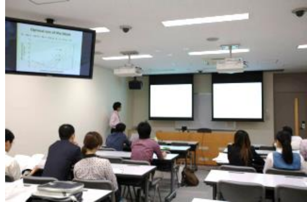
Parallel session 2