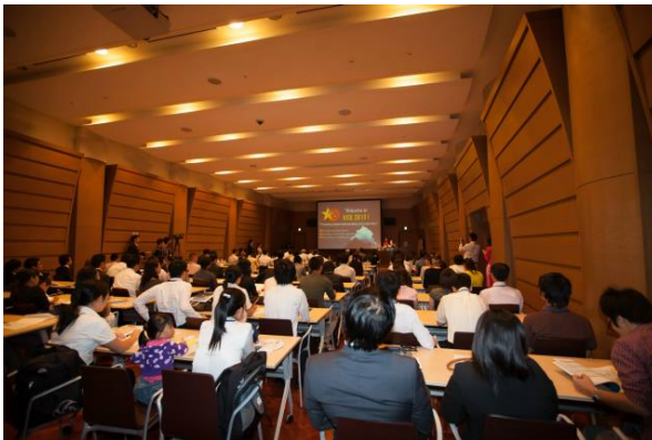
The opening ceremony