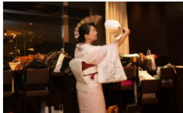
A Japanese traditional dance in the banquet