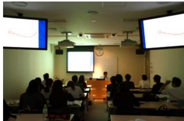
Parallel session 4