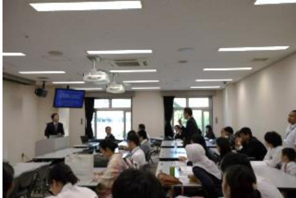
Parallel session 1