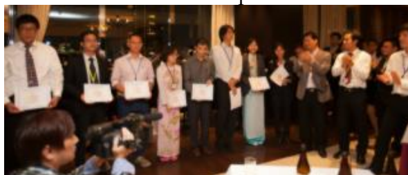
"Best presentation" award in the banquet