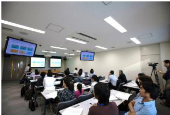
Parallel session 3